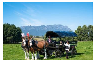
Almost Heaven Clydesdales