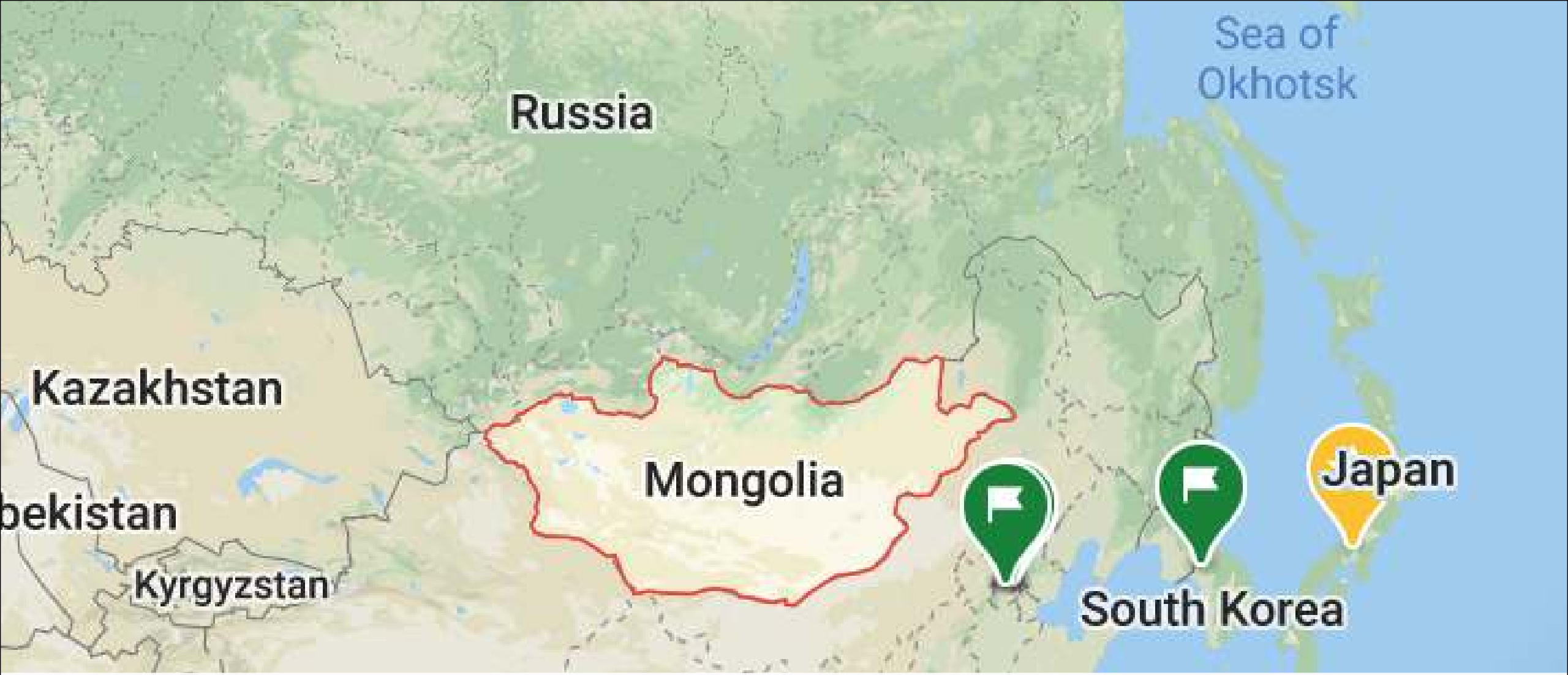
Mongolia on a map